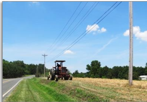
Biodiversity plot drilled in June in a narrow strip non-cropped due to limited access with larger equipment.