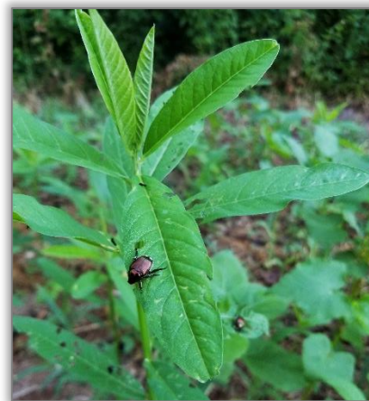
A high prevalence of Japanese Beetle pests observed feeding on Sunn Hemp. Potential for "trap cropping" and allow natural enemies to reduce crop pest pressure.