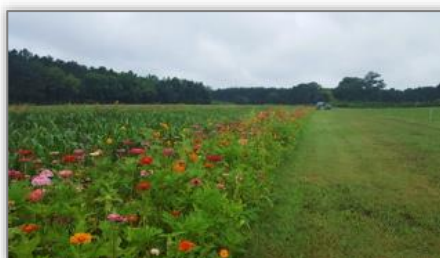
A biodiverse planting alongside sweetcorn and vegetable crops provides habitat and insectary benefits to the farm.

Planting a mixture of warm-season species as diverse plant “banks” is intended to provide: habitat for wildlife and beneficial insects , flowers for pollinators , biomass for soil structure , and weed suppression through good leaf canopy cover during a season of intense cropping. This is the focus of this factsheet, to improve the biodiversity of a farm of any scale and production system through simple, summer plantings of a mixed species of plants.